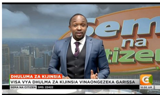
Garissa County Accelerate Research Dissemination featured on Citizen News