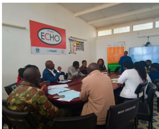
Iten Referral Hospital HCW CME