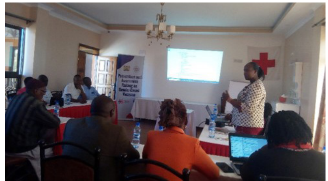
Samburu CEC-Gender addresses strategic meeting in Narok County