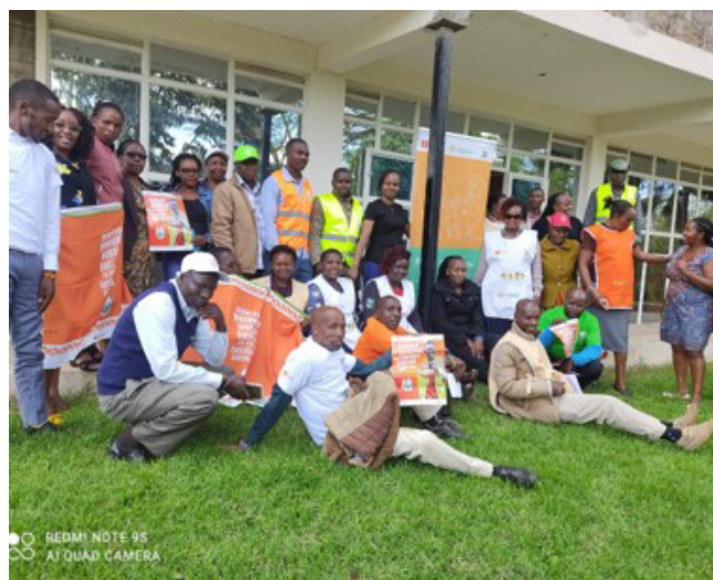
CHVs sensitization in Narok