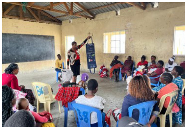
A community session in Kajiado