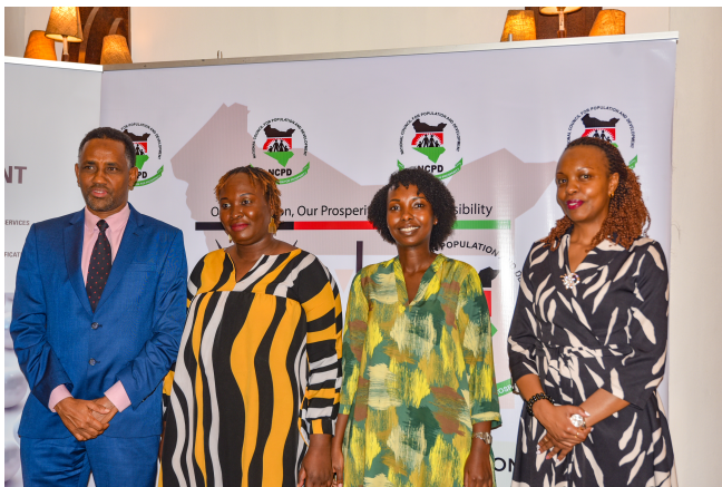
Accelerate project at NCPD's 40 th anniversary