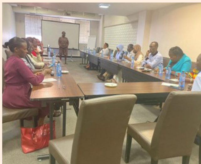
SCHMT/Facility in-charges Langata - Kibra