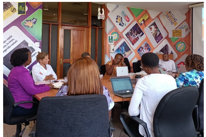
Accelerate project meeting at Chanuka Board-room in PS Kenya