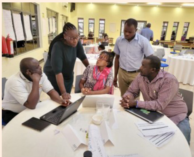
Group discussions at FP Sustainability and gender meeting