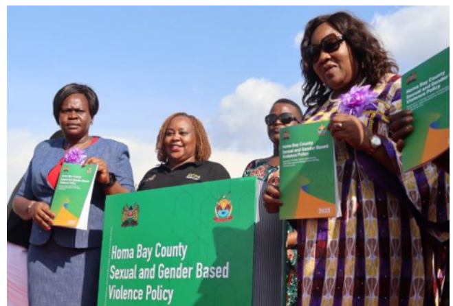
Launch of GBV Policy at Homabay County