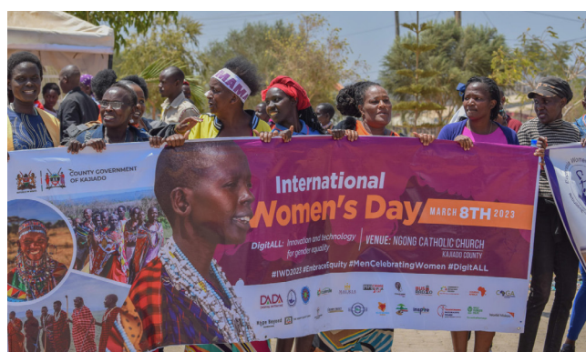
Accelerate Project was at the 2023 International Women's Day celebrations in Kajiado County

Queens program, distribution of IECs and OJTs on data collection and reporting.