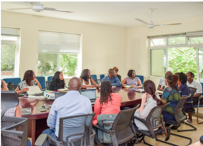
Binti Shupavu project hosts donor visit with CIFF in Kilifi County in February 2023