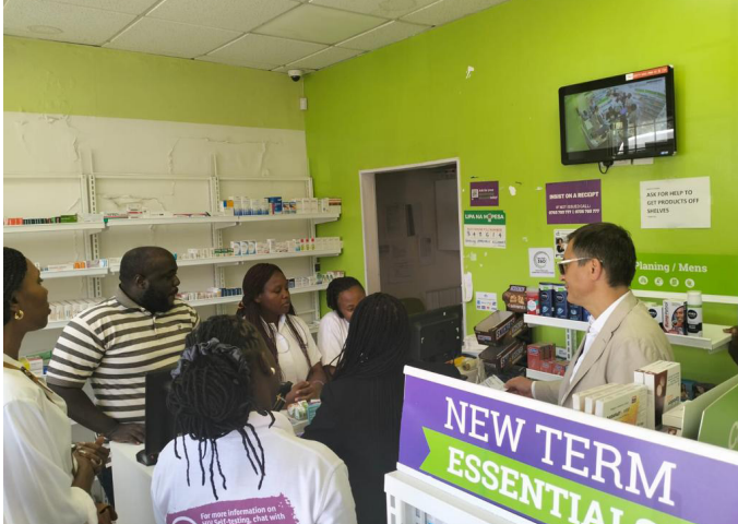
SHIPs Project hosts CIFF Founder, Chris Hohn at GoodLife Pharmacy in Nairobi County in January 2023