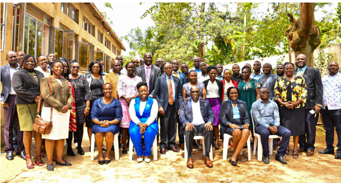
PS Kenya was invited to a consultative partners meeting hosted by Busia County Governor and Dep. Governor, where the Global Fund Malaria Project team had an opportunity to highlight the various successes and challenges of the project.