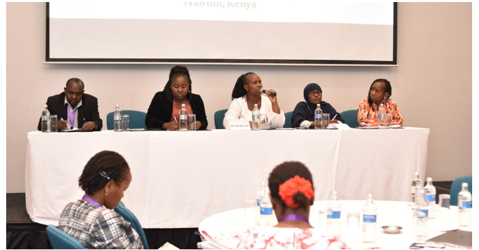
DESIP panel discussion on the interlinkage between maternal health and family planning at Radisson Blue Hotel on 8th March