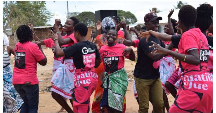
The Binti Shupavu fest held on 23rd March in Marekebuni, Malindi Sub-county