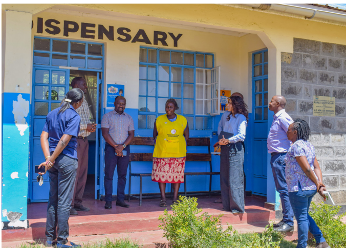
VAN Project hosts Rockefeller Foundation in Nakuru County in February 2023