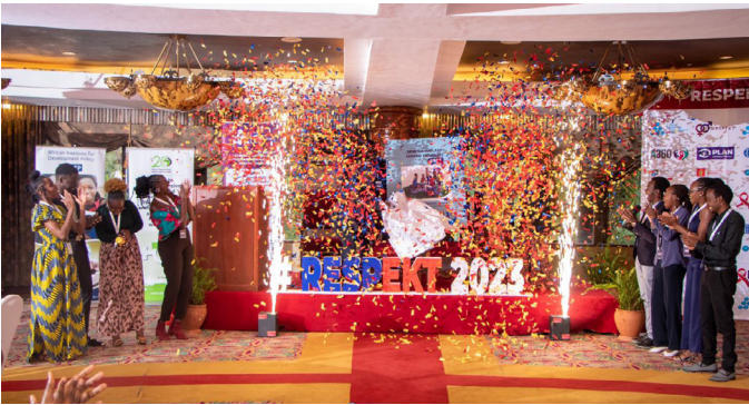
The A360 Program attended the Respekt 2023 Conference held at Safari Park Hotel on 17th March