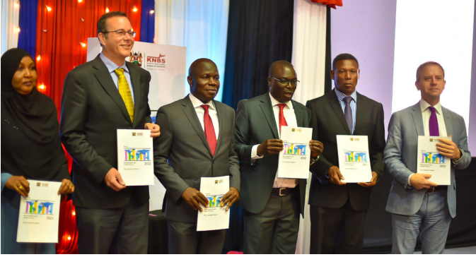
The launch of the 2022 Kenya Demographic and Health Survey (KDHS) on 17th January at KICC