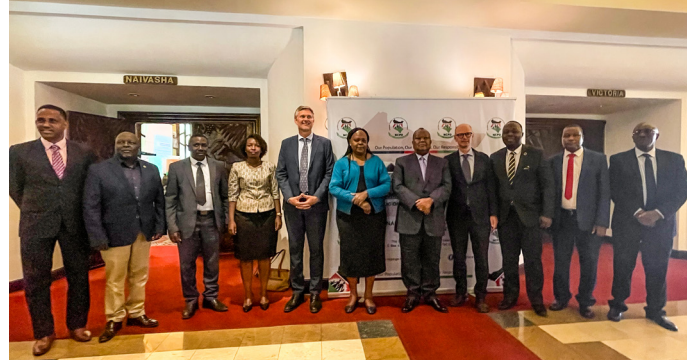
PS Kenya joined NCPD in marking the 3rd anniversary of the Nairobi Summit on ICPD25 on 14th February at Safari Park Hotel