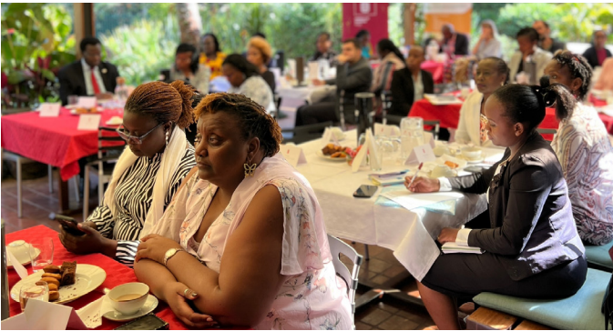
PS Kenya took part in the 4th Human Rights Cafe hosted by DANIDA on 23rd February.