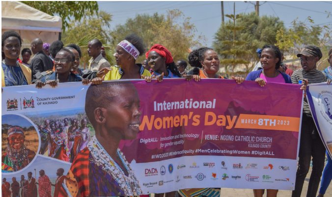
The Accelerate Project attended the International Women's Day 2023 event in Kajiado County on 8th March