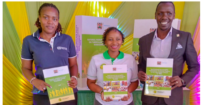
PS Kenya participated in the launch of TB policy documents 'National Workplace Policy for TB' and 'Multi-sectoral Accountability Framework to Accelerate Progress to End TB in Kenya by 2030' during the World TB Day celebrations in Eldoret