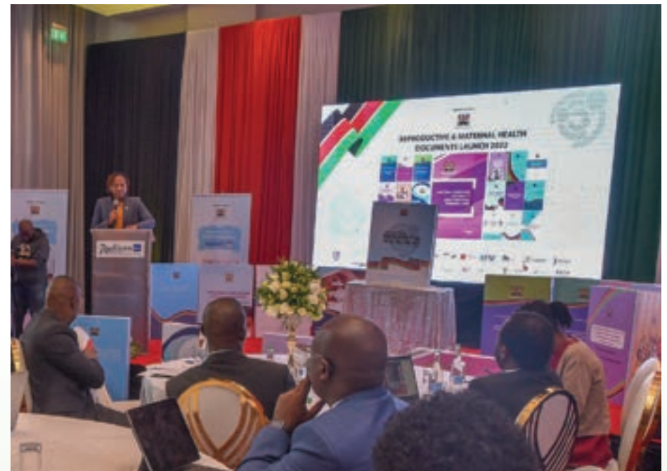
Ministry of Health launching 14 Reproductive and Maternal health documents.

The existence of these guiding policies and strategies is a step in the right direction in addressing the gaps that inhibit the provision of quality reproductive health services and information to those who need them. PS Kenya's Reproductive Health Coordinators (RPCs) will hold meetings with the different County Health Management Teams to decide on appropriate dissemination dates.