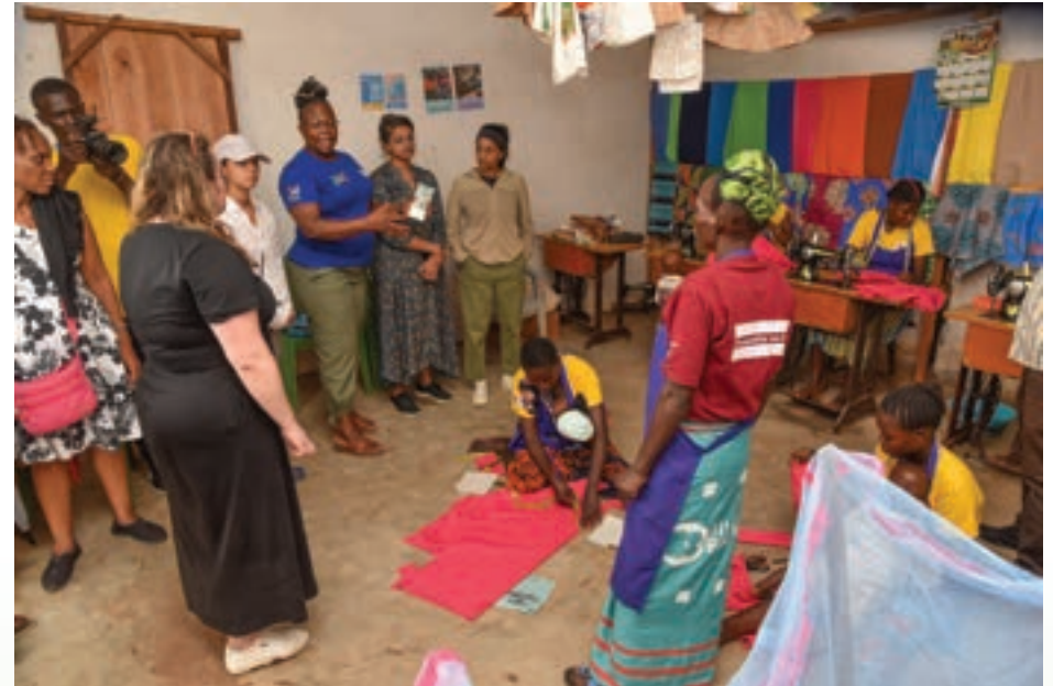
Visit to a mentorship site by the Maverick fellows.