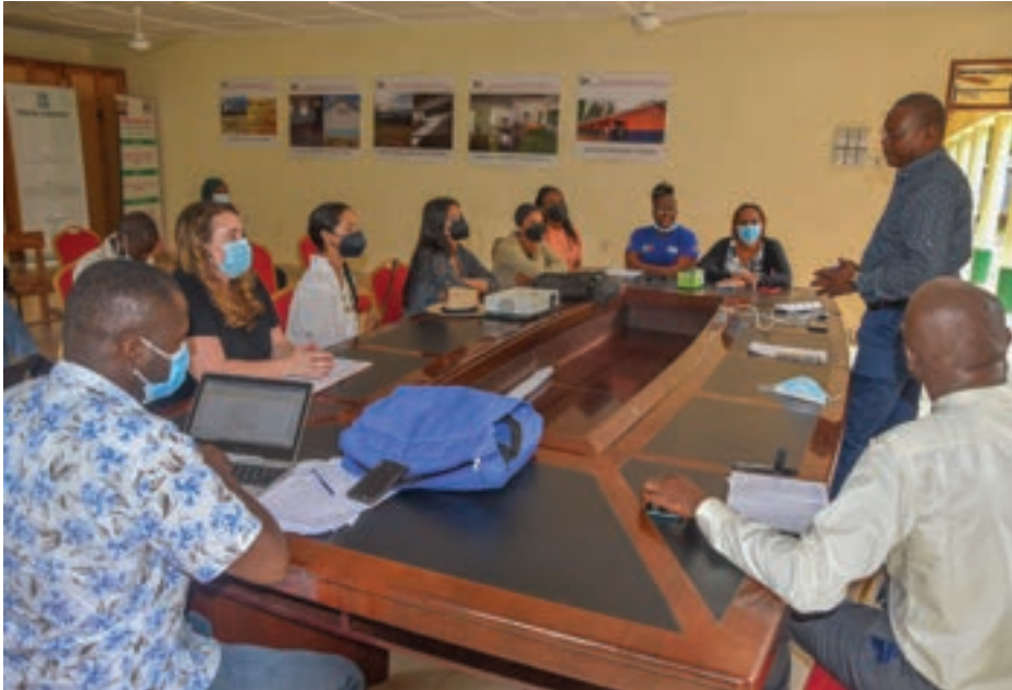
Maverick Next Fellows meeting with the County Health Team.

PS Kenya has had a strong partnership with Kilifi County and has implemented several maternal and reproductive health projects in the county, the recent one being the Maverick Project (Project Riziki) that was succeeded by the current Maverick Next Project. Since inception the county has offered great support which has seen realization of the project goals. With such a strategic partnership, PS Kenya is committed to ensuring that more young women benefit from such noble projects.